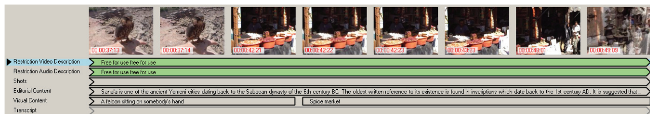
Rights Annotation in Interplay Cataloger: Green - “free” segments; red - “restricted” segments

Rights Retrieval is integrated in the search capabilities of Interplay Web Retrieval. Users can search and retrieve assets with specific global rights. Using the strata search, users can also search for a segment in video assets that has specific keywords and specific rights.