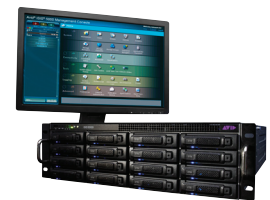
Avid ISIS 5000