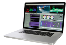
Avid Media Composer