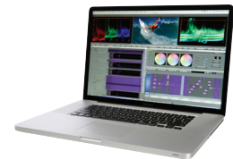
Avid Media Composer