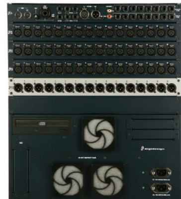
Mix Rack back panel

Corporate Headquarters 800 949 AVID (2843)