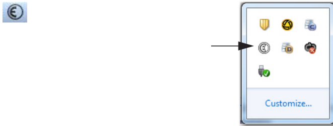
EuControl icon for Artist Series on Mac (left) and Windows (right)

Artist Series Make sure you have installed the current version of EuControl software and make sure it is running, indicated by a lit EuControl icon in the Menu bar (Mac) or System tray (Windows).